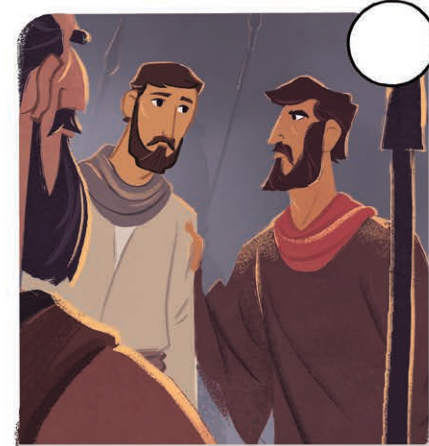
A CROWD GRABBED JESUS AND ARRESTED HIM.