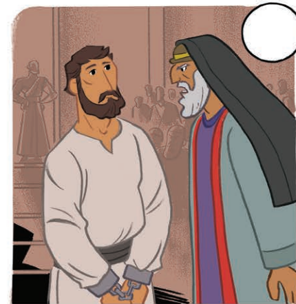
PILATE HANDED OVER JESUS TO THE CROWD TO BE CRUCIFIED.