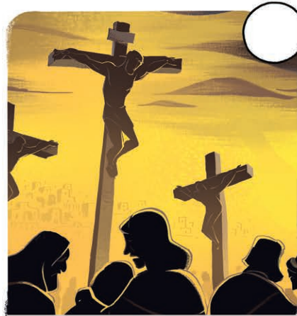
SOLDIERS NAILED JESUS TO A CROSS. HE DIED.