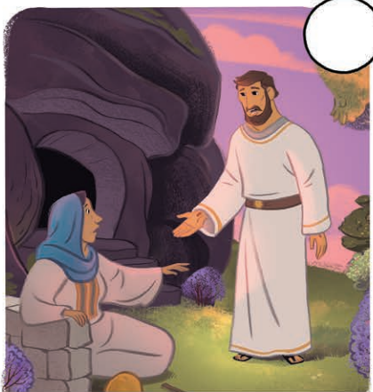
ON THE THIRD DAY, JESUS ROSE FROM THE DEAD.